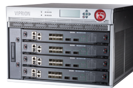
VIPRION 4480 Chassis